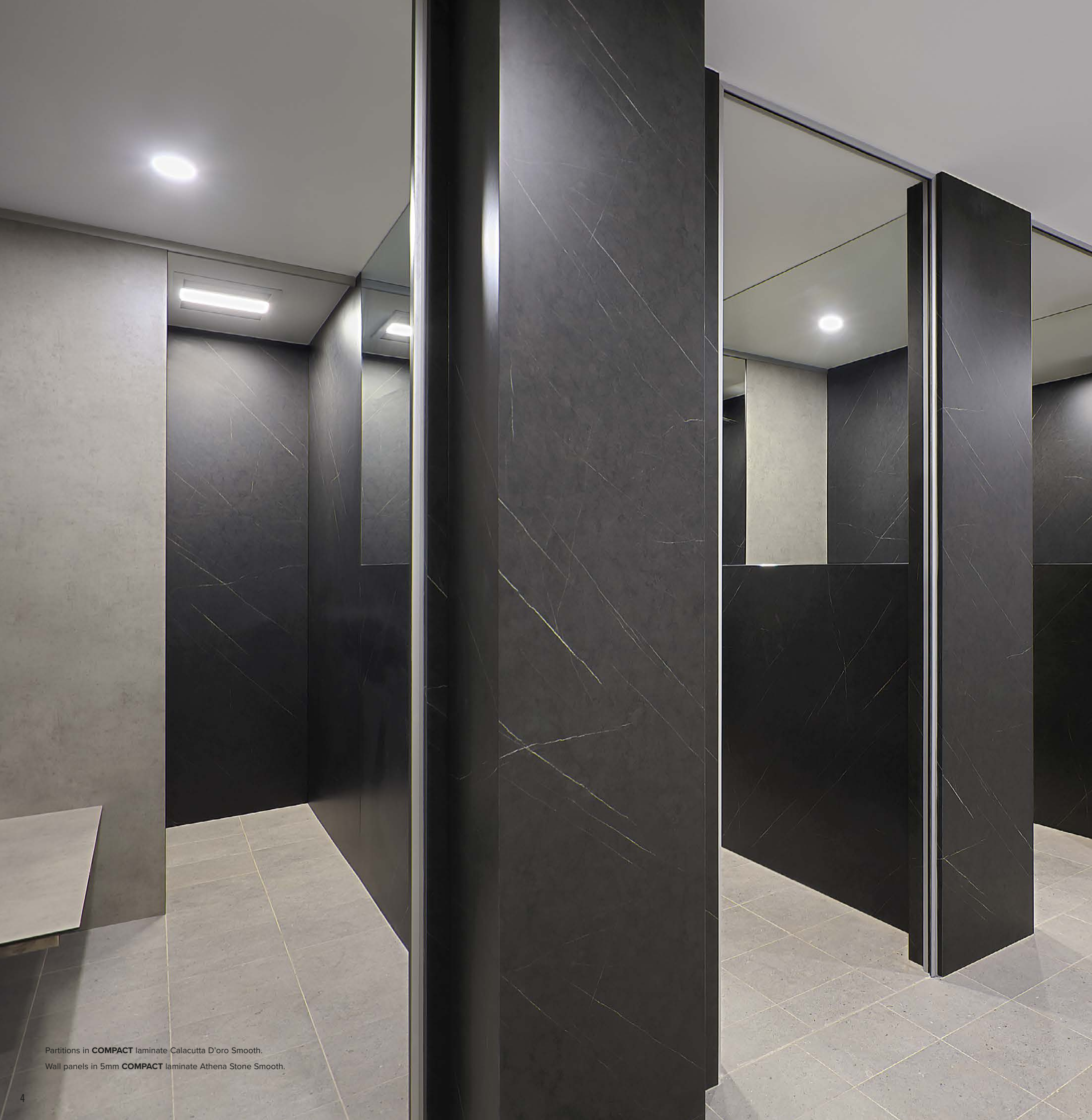
Partitions in COMPACT laminate Calacutta D'oro Smooth. Wall panels in 5mm COMPACT laminate Athena Stone Smooth.