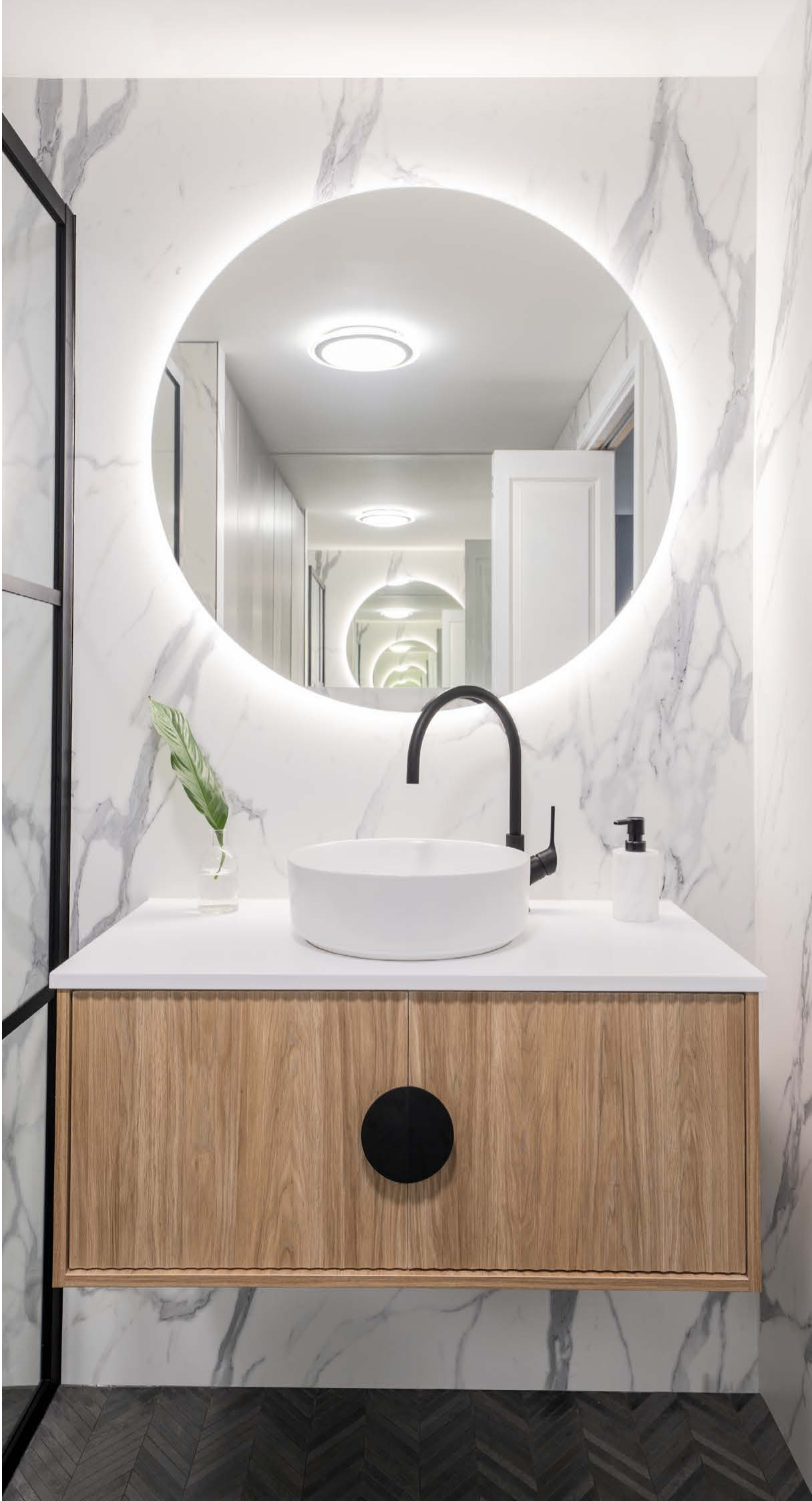
IMAGE RIGHT: Wall panels in 5mm COMPACT laminate Calacutta Grey Smooth.

Available finishes M = Matt Wm = Woodmatt