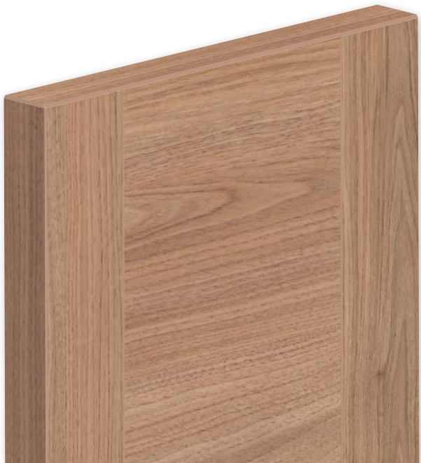
COVER IMAGE: Avellino doors in DECORATIVE 16mm Notaio Walnut Woodmatt. Shelving in DECORATIVE 16mm Black Matt. Bevel Edge drawers in DECORATIVE 18mm Cinder Venette with Copper Leaf Matt rails. Benchtop and splashback in LAMINATE Tunisia Stone Matera.