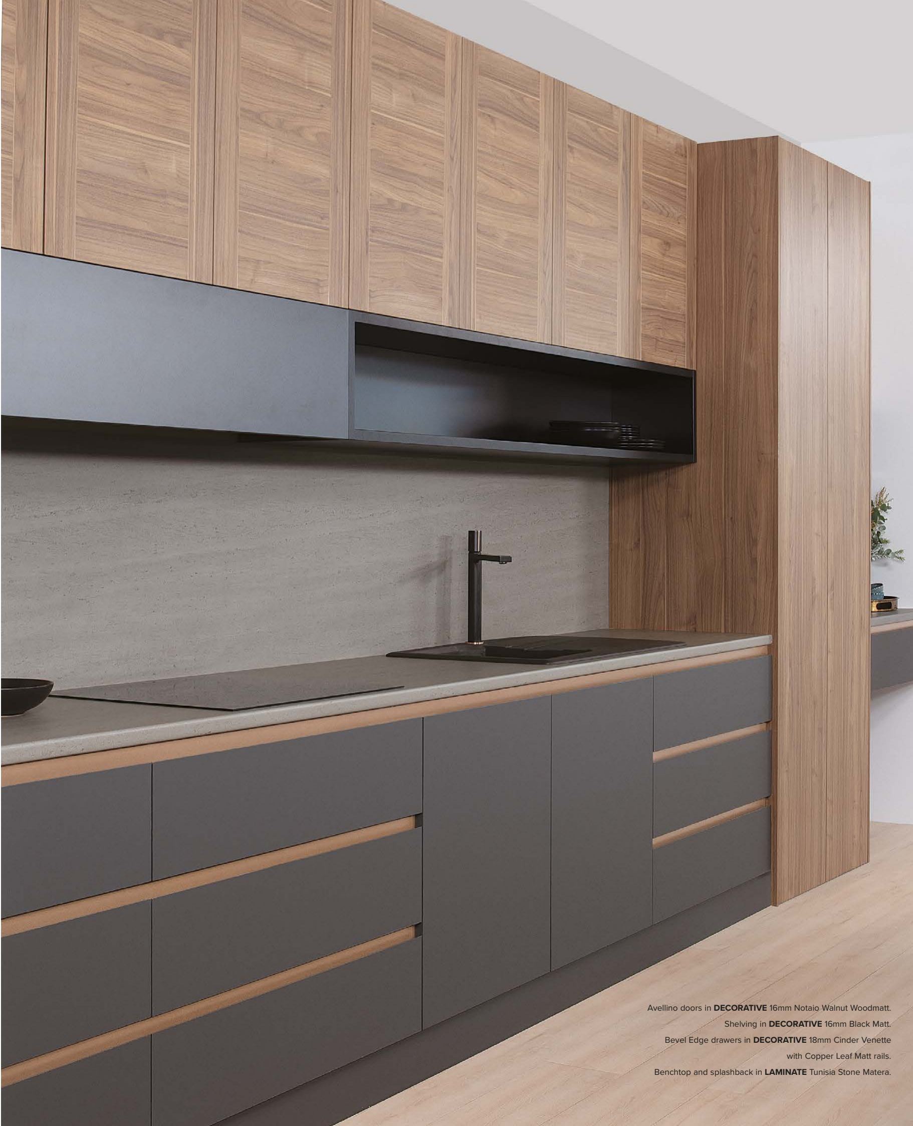
Avellino doors in DECORATIVE 16mm Notoia Walnut Woodmatt.