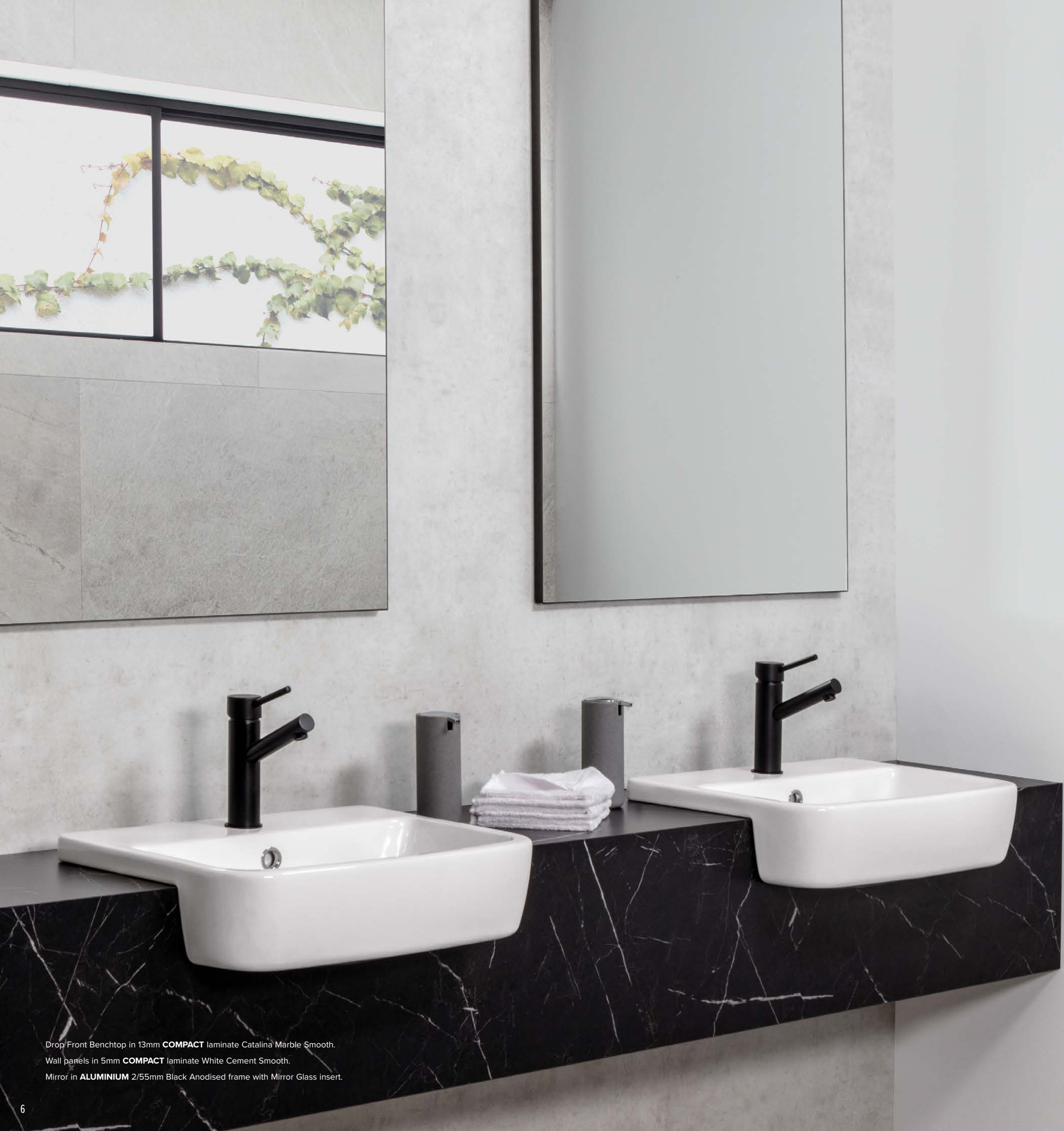
Drop Front Benchtop in 13mm COMPACT laminate Catalina Marble Smooth. Wall panels in 5mm COMPACT laminate White Cement Smooth. Mirror in ALUMINIUM 2/55mm Black Anodised frame with Mirror Glass insert.