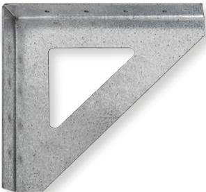
300 x 300mm Support Bracket

COVER IMAGE: Drop Front Benchtop in 13mm COMPACT laminate Tivoli Ceppo Smooth. Mirror Panels with Black edge.