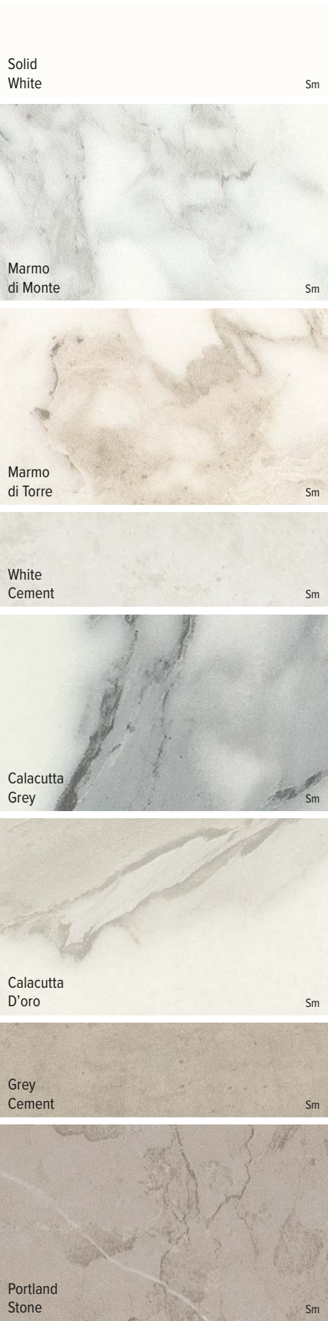
Available finishes Sm = Smooth

polytec swatches and samples represent a small area of the overall colour structure. To view the large colour sample, visit www.polytec.com.au . Dark coloured surfaces will show fingerprints and require more care and maintenance than lighter coloured surfaces. It is recommended to test a product sample prior to colour selection.