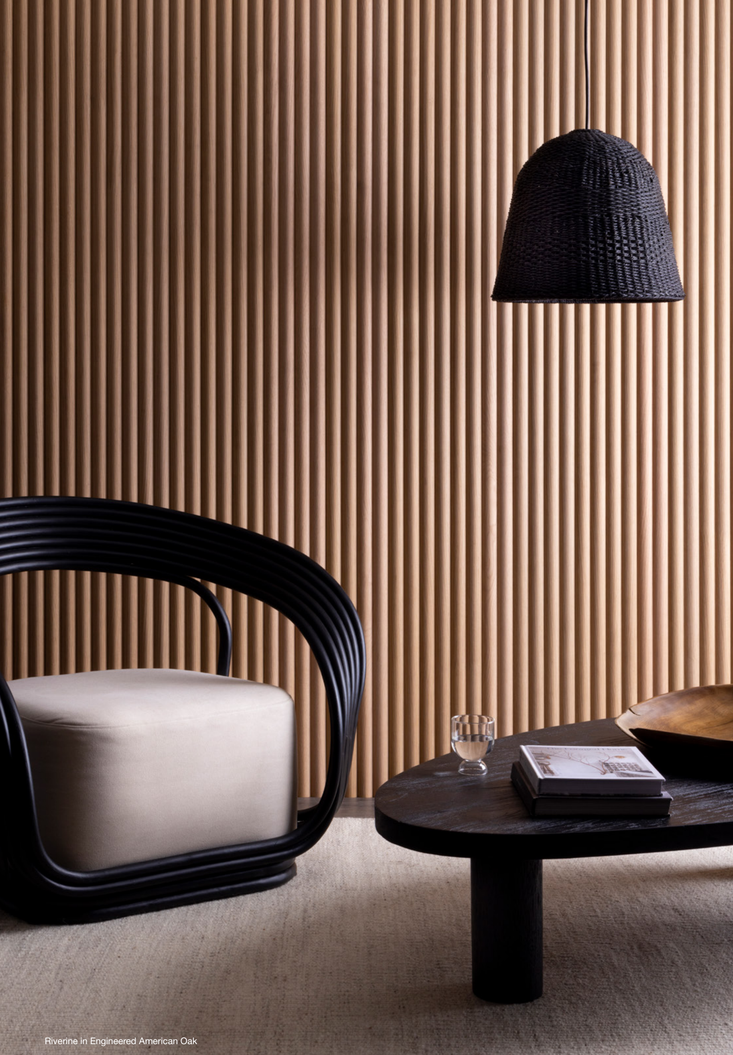
Riverine in Engineered American Oak