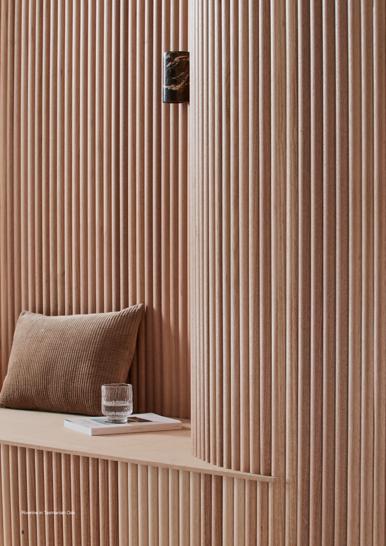
Riverine in Tasmanian Oak