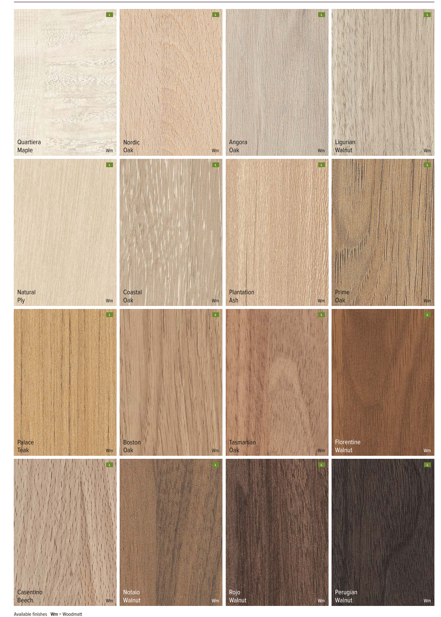
polytec swatches and samples represent a small area of the overall colour structure. To view the large colour sample, visit www.polytec.com.au. Dark coloured surfaces will show fingerprints and require more care and maintenance than lighter coloured surfaces. It is recommended to test a product sample prior to colour selection.