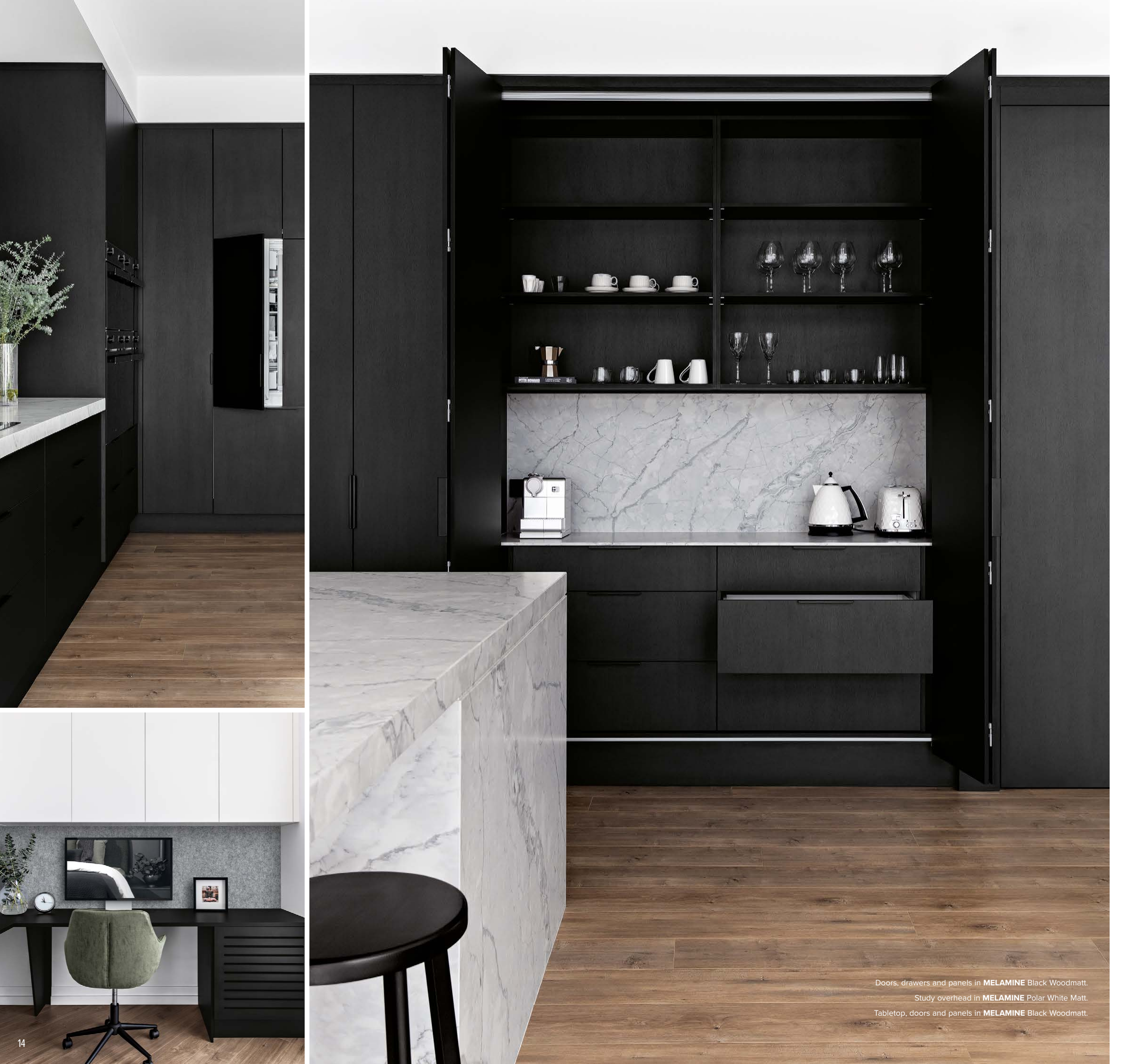
Matt, Texture, Sheen