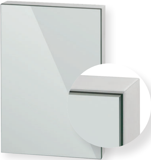
Mirror with White edge