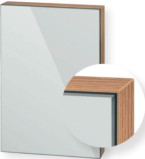
Mirror with Natural Oak edge

polytec's latest Mirror Panels products are made from 16mm particleboard substrate with 4mm glass, available in White and Black Matt options. polytec's Mirror Panels are available with a standard annealed mirror, and smokey mirror options.