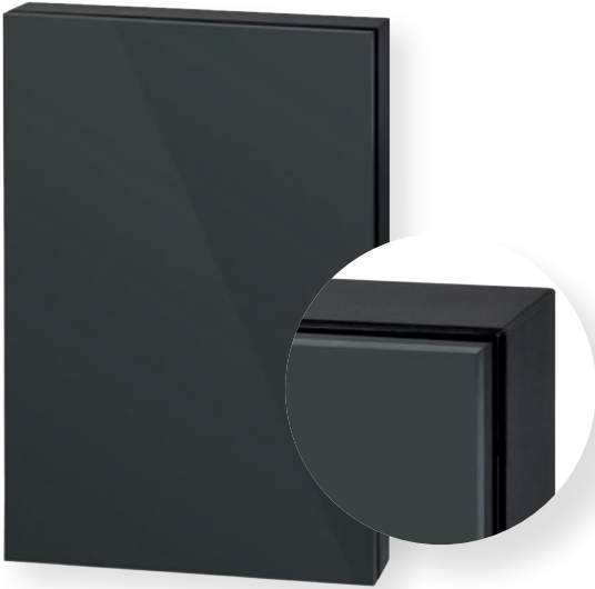
Smokey Grey Mirror with Black edge